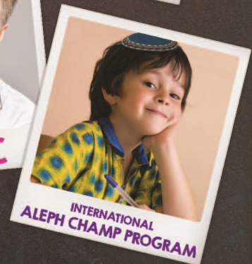
INTERNATIONAL ALEPH CHAMP PROGRAM